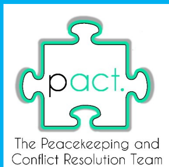
The Peacekeeping and Conflict Resolution Team

We have been searching for a host to plant in the idea of a community mediation competition. A major chunk of mediation cases in India belong to this category and it was important to dedicate a competitive event to this category of disputes. PACT is excited to be working with ILSCA on this project and we are confident of moulding it into a unique challenge for all those students who dare to challenge their skills in disputes arising and affecting the non-corporate world.