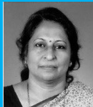
Director, ILS Centre for Arbitration

The mediation competition titled 'INTERCESSIONIS' is a maiden attempt by the Indian Law Society's Centre for Arbitration and Mediation (ILSCA). This Mediation competition is a unique initiative that aims to render potential lawyers in Mediation, to one of the widely followed techniques of alternate dispute resolution.